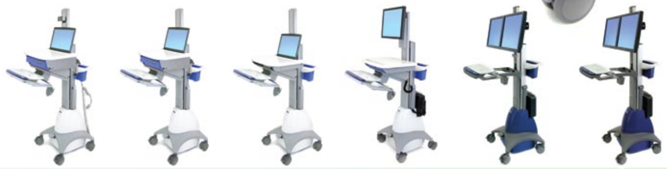
Notebook Cart powered with autolock drawer Notebook Cart non-powered with autolock drawer Notebook Cart non-powered LCD Cart non-powered Dual Display Cart powered Dual Display Cart non-powered