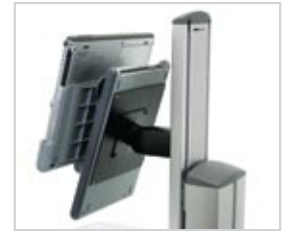
Tablet PC Pivot Extension 47-095