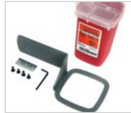
Sharps Container and Bracket 60-570-201