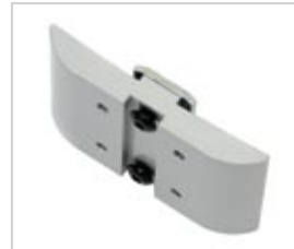
T-Slot Bracket 60-575-003