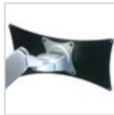
Interface Bracket for Motion Computing LE1600 Tablet PC 60-579-200 black

Compatible with any LCD mount that uses a VESA MIS-D mounting hole pattern