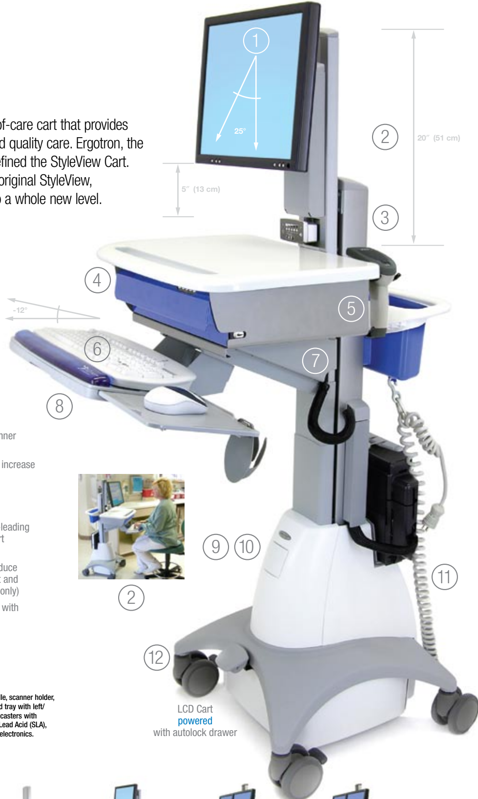
LCD Cart powered with autolock drawer

Standard cart features: worksurface (except Dual Display Cart), basket and rear handle, scanner holder, cable management system, universal CPU holder (LCD models only), full-size keyboard tray with left/right mouse tray, gel wrist rest, mouse holder, height position lock, high-performance casters with dual wheels for carpet or hard floor use. Powered carts include 55Ah, 12VDC, Sealed Lead Acid (SLA), Absorbed Glass Mat (AGM), Deep Cycle, Valve Regulated type battery with supporting electronics.