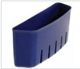
Storage Basket 99-160-063