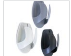
Mouse Holder 99-033-099 grey 99-033-064 dark grey 99-033-085 black