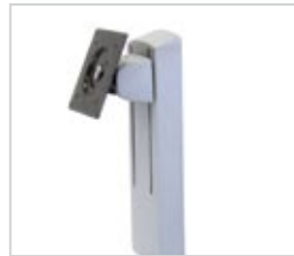
SV 5" (13 cm) Lift Monitor Pivot Retrofit Kit 99-167-057

These optional accessories, including lockable medication drawers and utility shelf, are engineered to increase productivity and reduce errors.