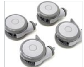
Carpet Casters 97-254