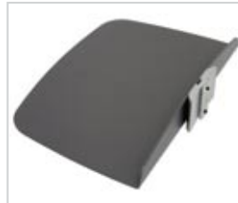
Utility Shelf 50-192-201