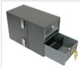
Locking Drawers 68-124-201