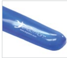
Gel Wrist Rest 85-043